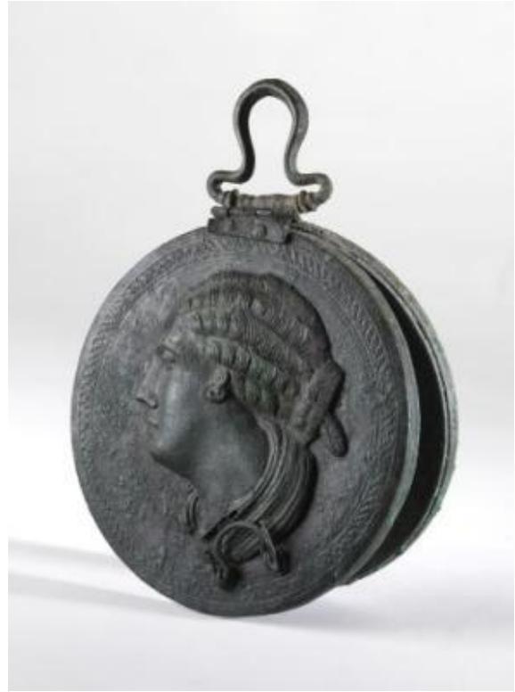
In this Feb. 12, 2015 photo provided by the Israel Museum is a bronze mirror with a woman's head in relief from the Hellenistic period. It is part of a major collection of ancient Greco-Roman and Near-Eastern objects that New York philanthropists Robert and Renee Belfer are giving a to the Jerusalem museum. (AP Photo/Israel Museum, Elie Posner) (Elie Posner/AP)