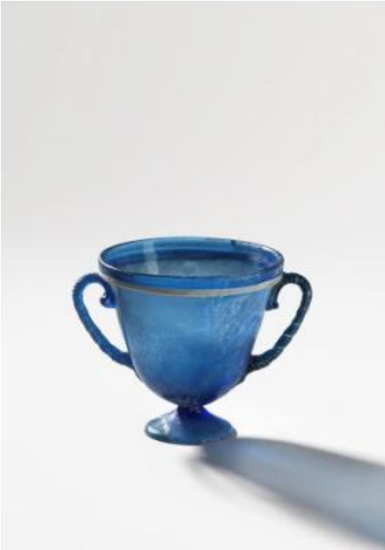
In this Feb. 12, 2015 photo provided by the Israel Museum is a first century blown glass kantharos. It is part of a major collection of ancient Greco-Roman and Near-Eastern objects that New York philanthropists Robert and Renee Belfer are giving to the Jerusalem museum. (AP Photo/Israel Museum, Elie Posner) (Elie Posner/AP)